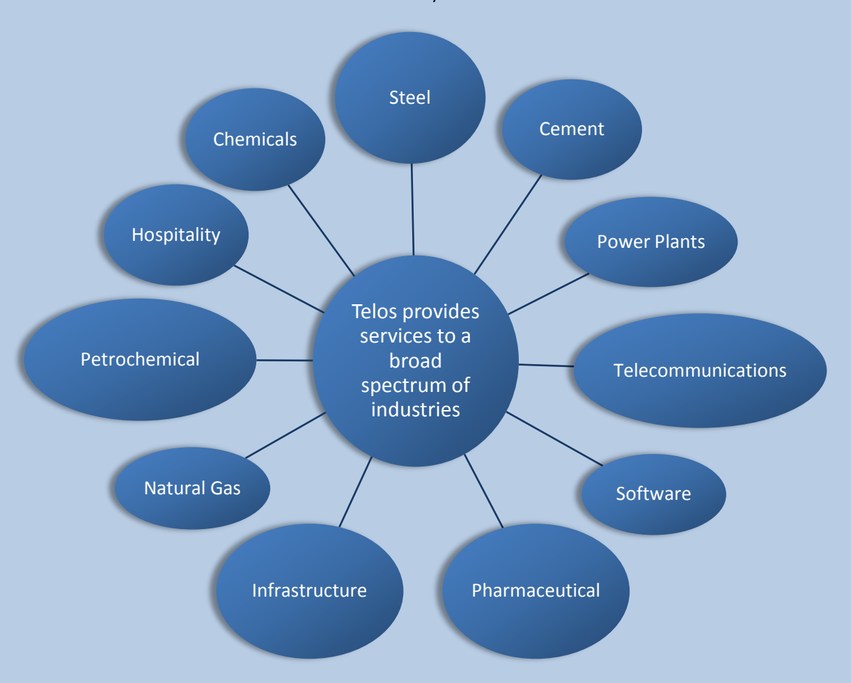
Telos Consultancy Services Pvt Ltd